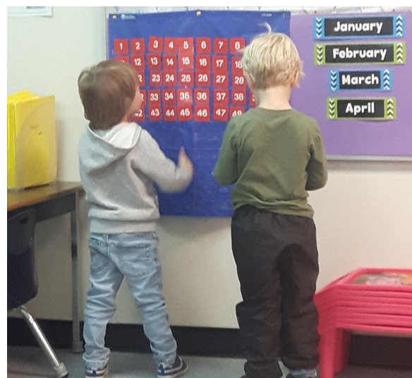
Students working in Miss Hunter's class.